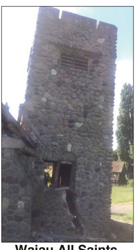
Waiau All Saints Church

Standard requirement for Presbyterian owned buildings. The Waiau All Saints Church has been severely damaged and is not salvageable